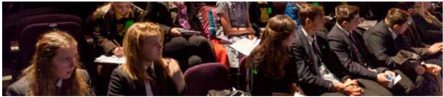
Big Share Day - Gulbenkian Theatre, Canterbury 26th April 2015

The whole of the Gulbenkian and Colyer Ferguson Concert Hall at the University became an INSPIRE Big Share space for young leaders from St Alphege Infants, Herne Infants, Bromstone, Newlands, St Nicholas, St Joseph's Primary Schools and St Anselms, King Ethelbert, Charles Dickens and Chatham and Clarendon Grammar School.